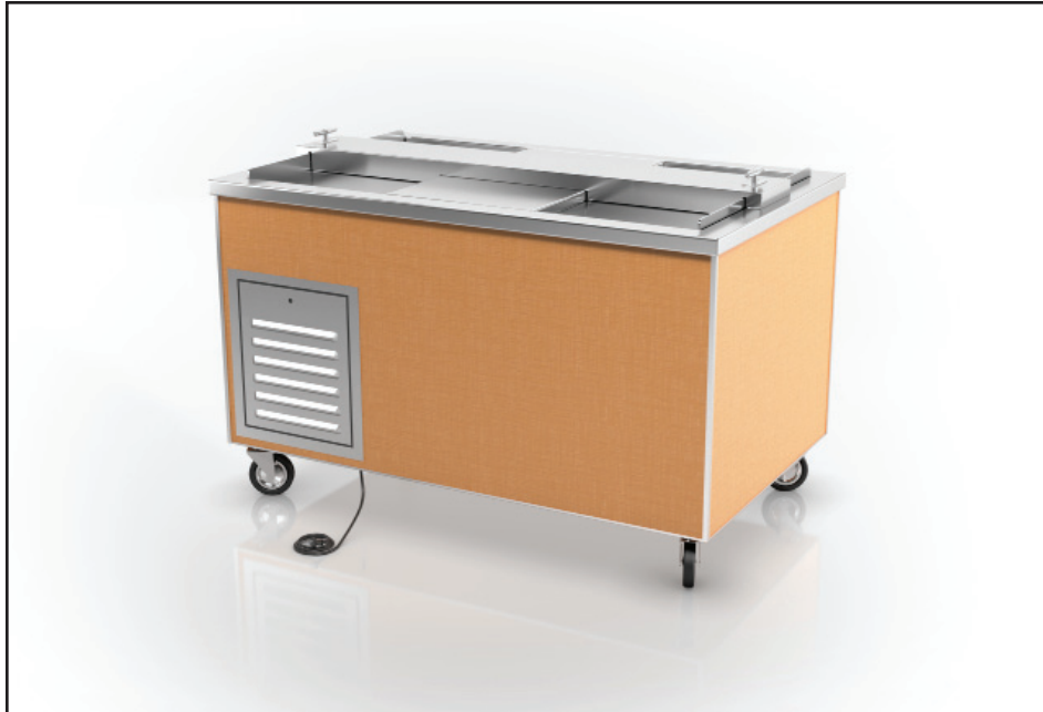
CPM-1310-L shown with option: (GG) lid locks.

Stainless Steel (S) or Laminate Panel (L)