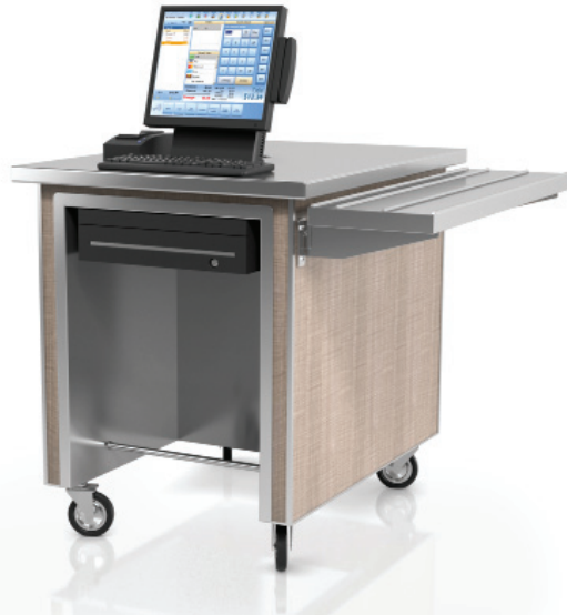
36-CSE-L shown with options: (A) beaded stainless steel tray slide, and (HH) locking cash drawer.