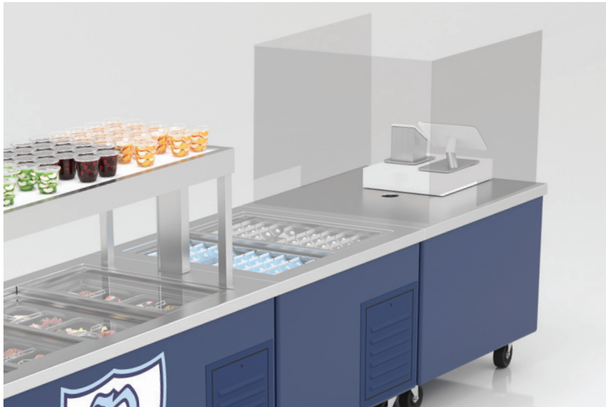
50-SCS-F shown with options: Personal protector shield, cashier drawer.