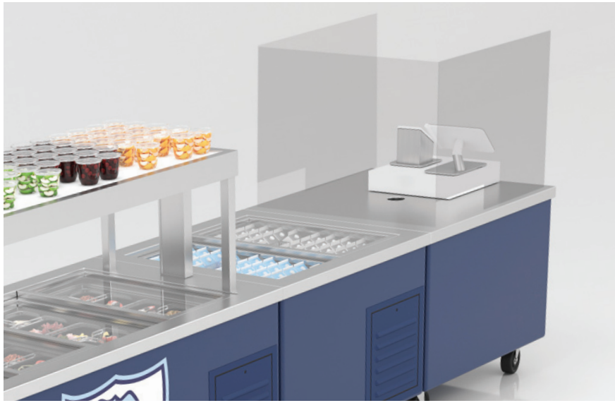
50-SCS-F shown with options: Personal protector shield, cashier drawer.