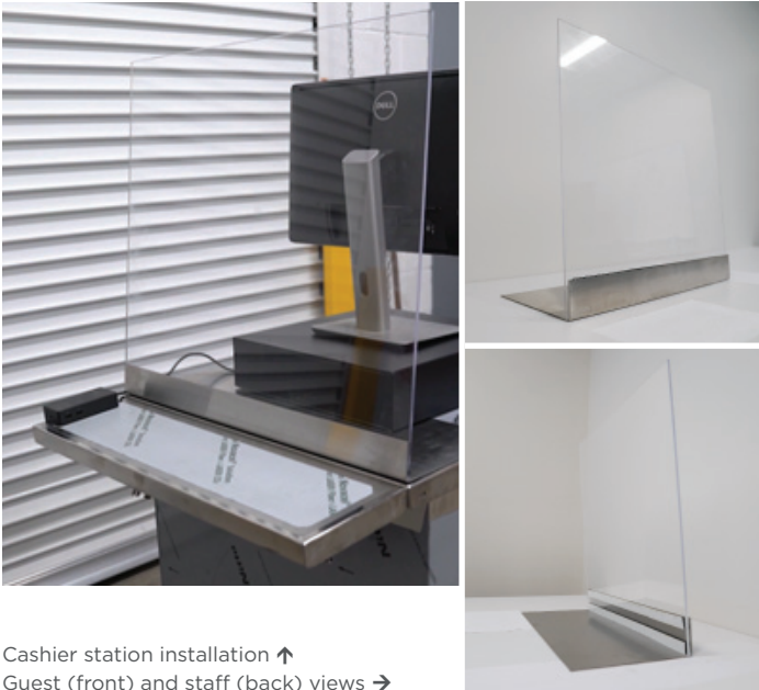
Cashier station installation ↑ Guest (front) and staff (back) views →

LTI's vertical barrier is free standing. That means tools are not required for installation and it can be added to any existing or new cashier counter.