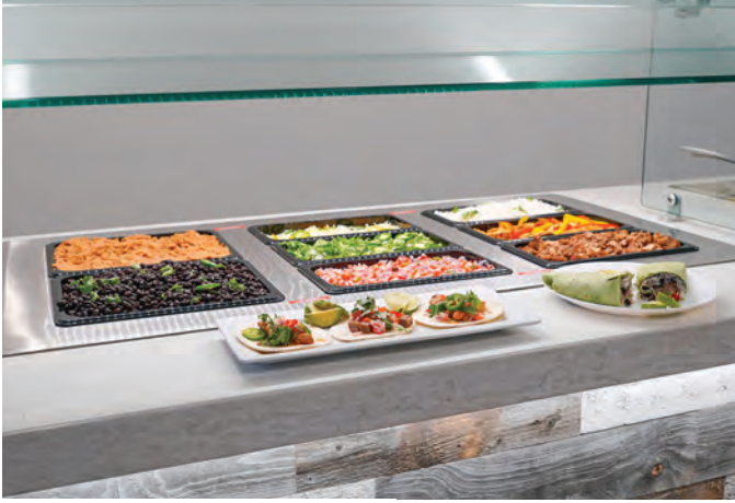
With or without water