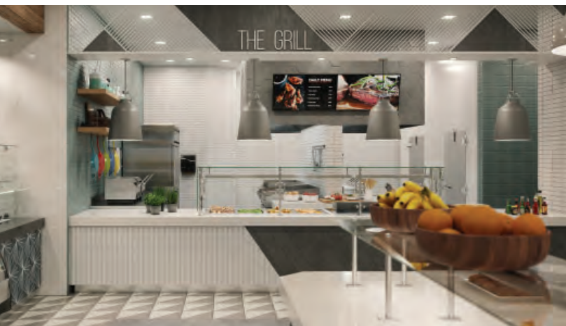
Imaginative material applications