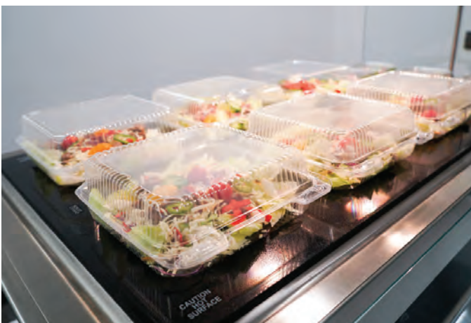
Fast temperature changes

QUICKSWITCH serving technology is the first of its kind—providing the ultimate in menu flexibility and merchandising options. With QUICKSWITCH , each countertop serving well is independently controlled to be hot, cold or frozen. So, whether it's pasta, soup, made-to-order salad or anything your latest menu calls for, LTI makes all your offerings easily visible and accessible.