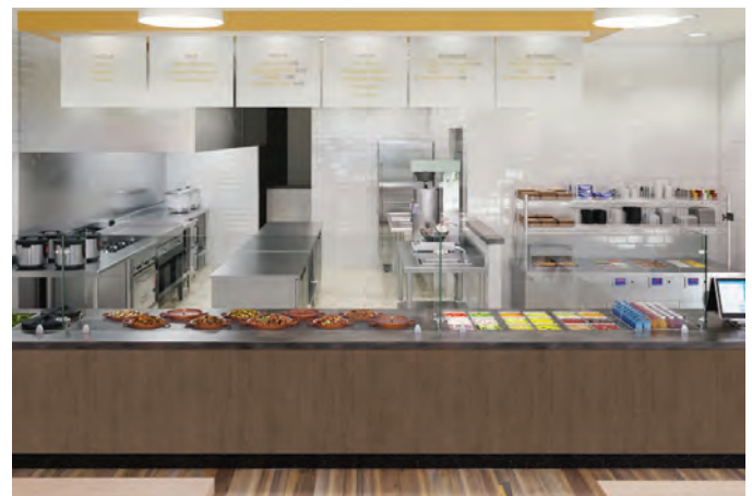
Accommodates all or LTI's serving technologies