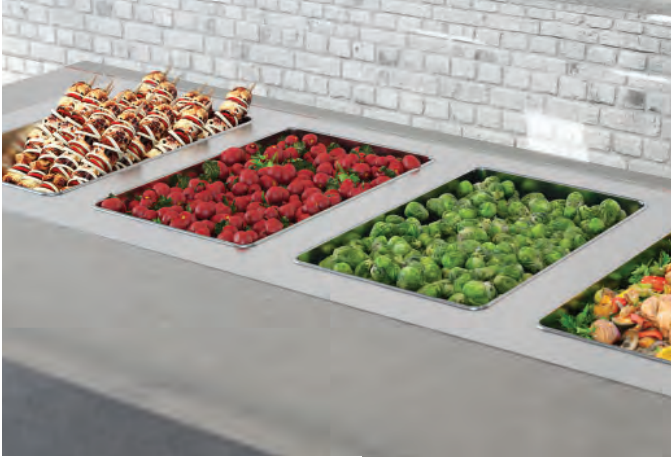
Independent food wells