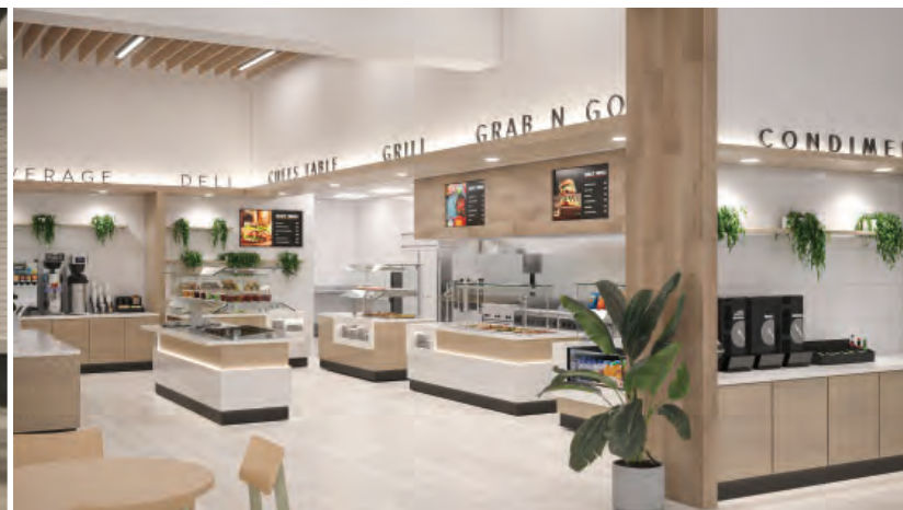
Branded serving environments