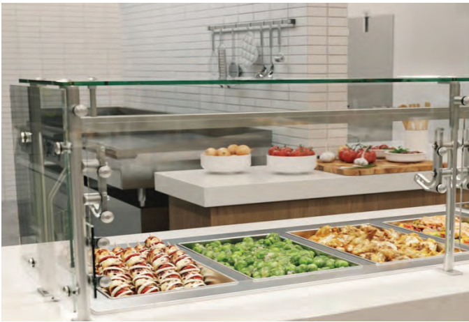
Change temperatures quickly