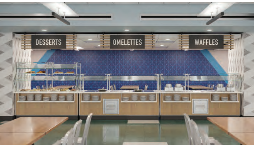
Modular counter bodies