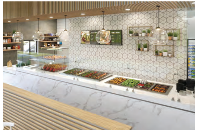
Available with custom materials