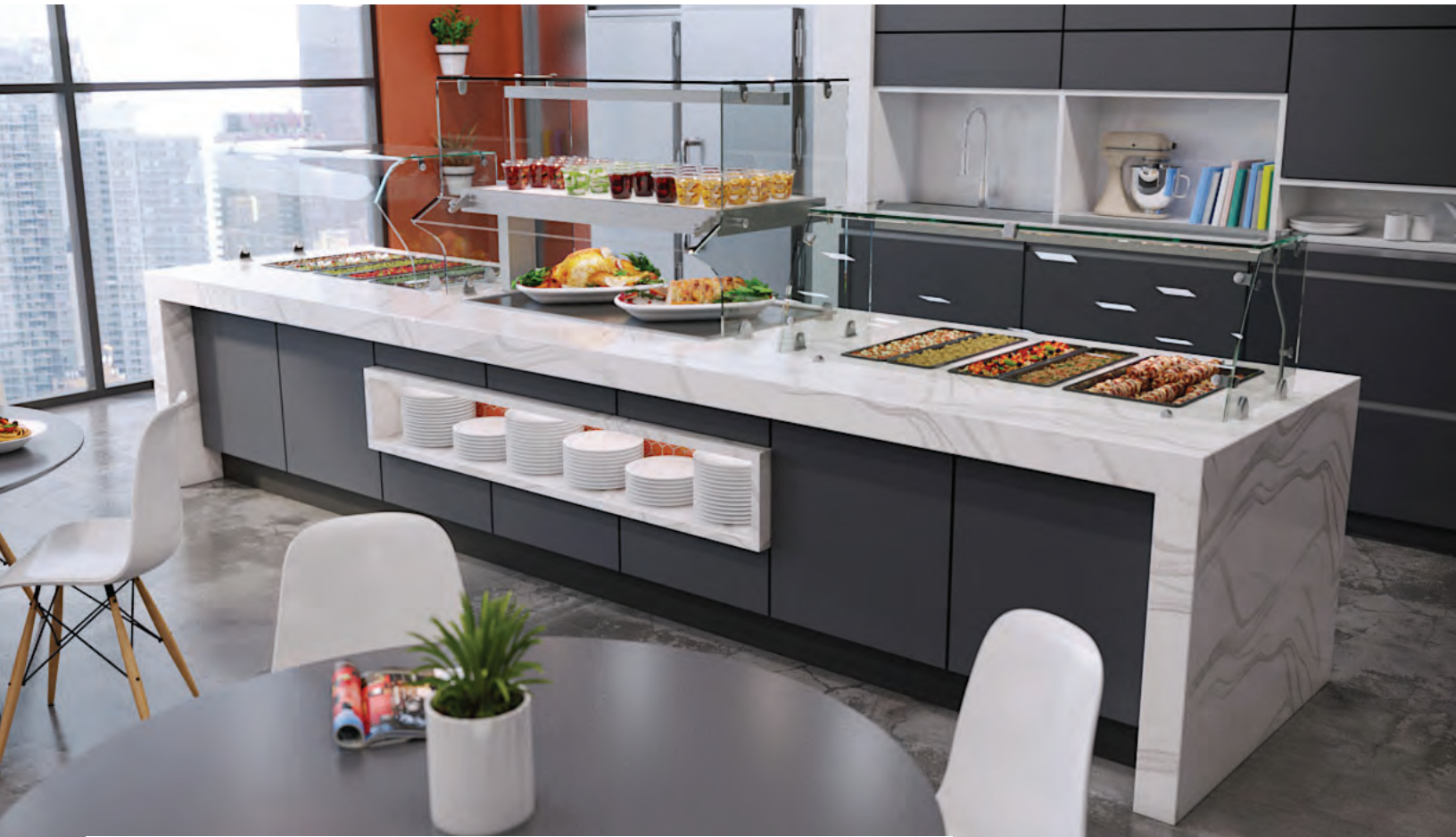
Design counter fronts and tops with a high-end look and feel