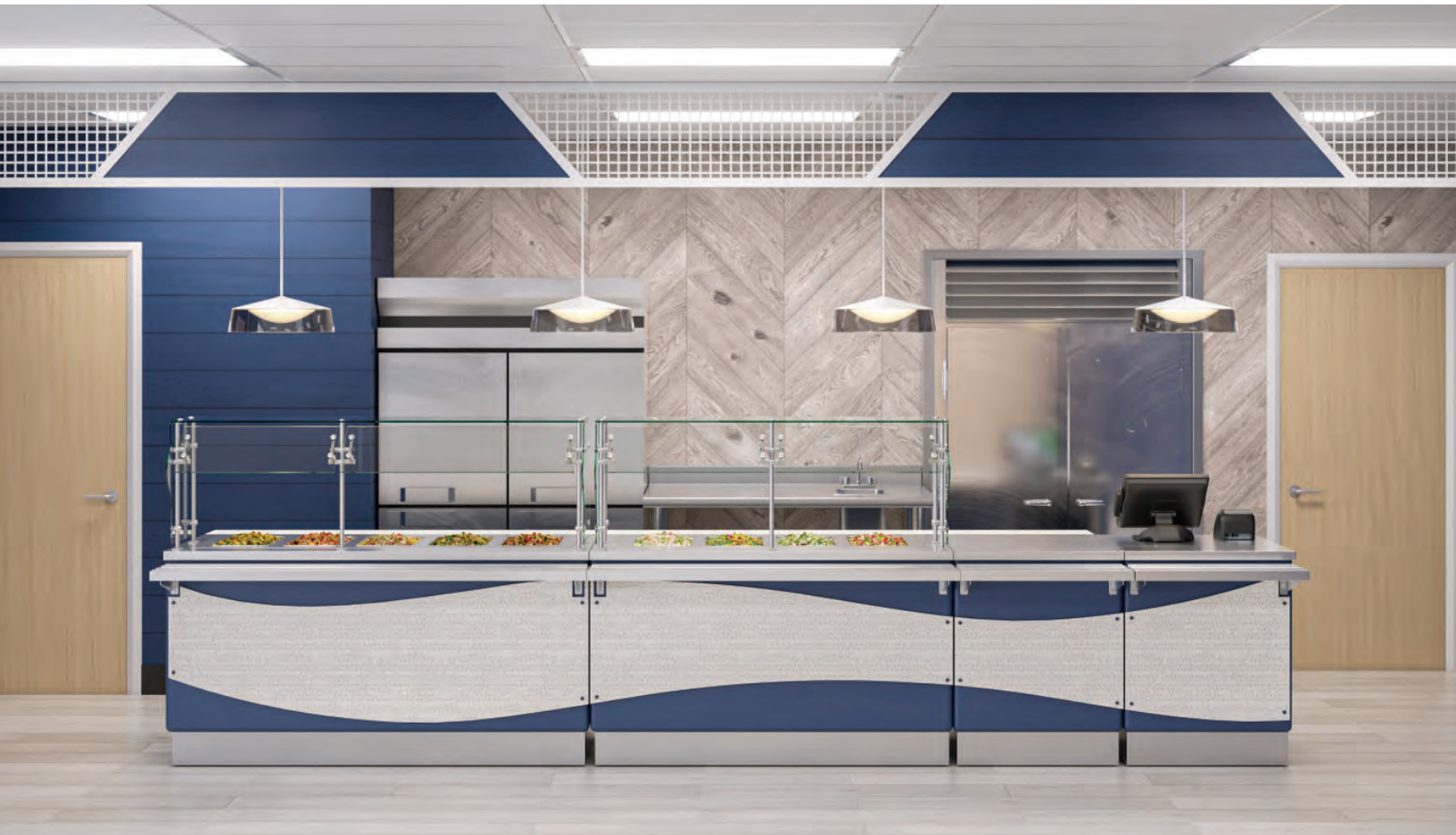
Timeless and durable