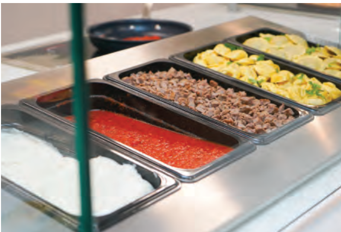
Exceeds NSF-7 standards

Our energy-efficient technology utilizes a silicone heat blanket that can be used with or without water inside the well. As operators look for new ways to conserve water while also moving away from the hassles of water-based wells and expensive induction equipment, THERMALWELL technology provides reliable performance with just half the energy of traditional hot wells.