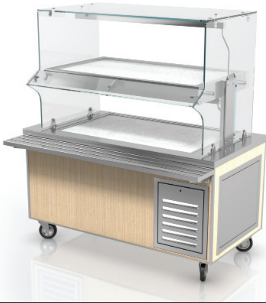
60-CFT-L shown with options: (A) beaded stainless steel tray slide, (OP) offset panels, a two tier frost top overstructure, and (RR) LED lights.