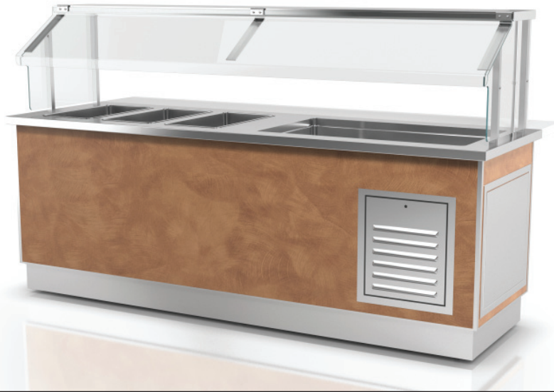
CPT-93-RX-L shown with options: (E) 8" wide Richlite® composite cutting board, (M) hinged single service buffet shield, and a removable stainless steel toe kick.