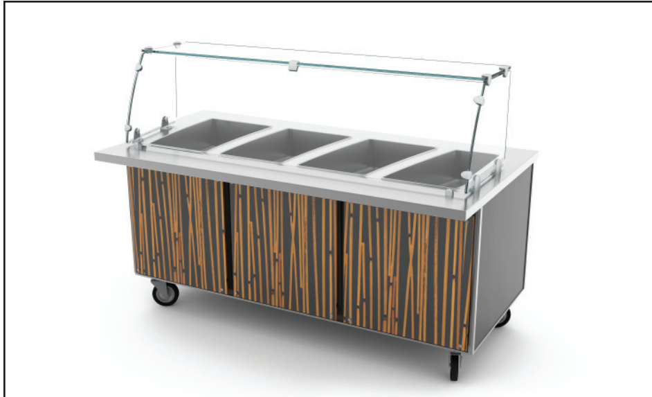
QSCHP-4-L shown with options: (OP) offset panels, (TEW) top width extension, and (CCP) curved tempered glass protector.

Stainless Steel (S) or Laminate Panel (L)