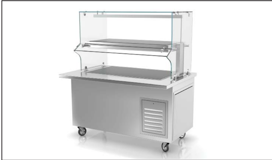
QSGT-42-2T-BI-S shown with options: (CT) Corian® top, (TE) top width extension, and (RR) LED lights.

Stainless Steel (S) or Laminate Panel (L)