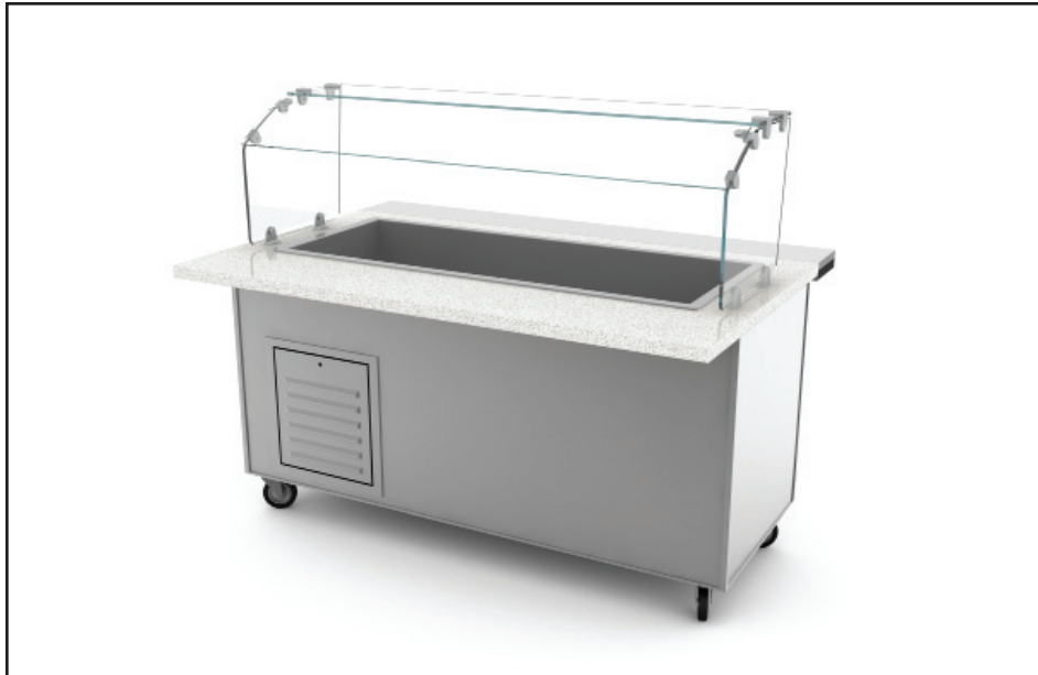
74-CFMA-L shown with options: (QT) stone top, (TE) top width extension, (E) 8" wide Richlite ® composite cutting board, and (CCB) curved tempered glass buffet shield.