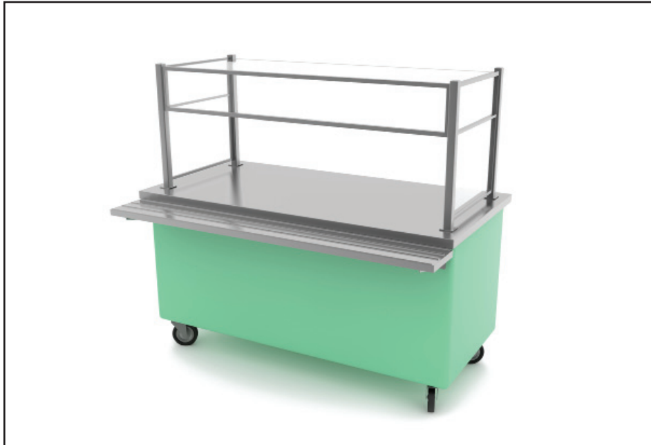
66-ST-F shown with options: (A) Beaded, stainless steel tray slide and (I) 2 tier display shelf, single service protector