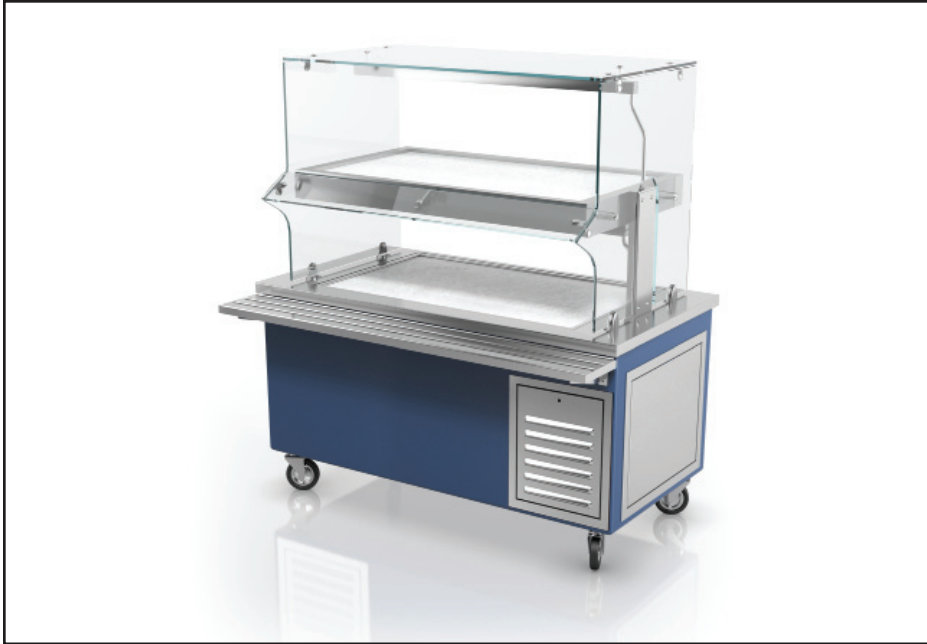
60-CFT-F shown with options: (A) beaded stainless steel tray slide, and a two tier frost top overstructure and (RR) LED lights.