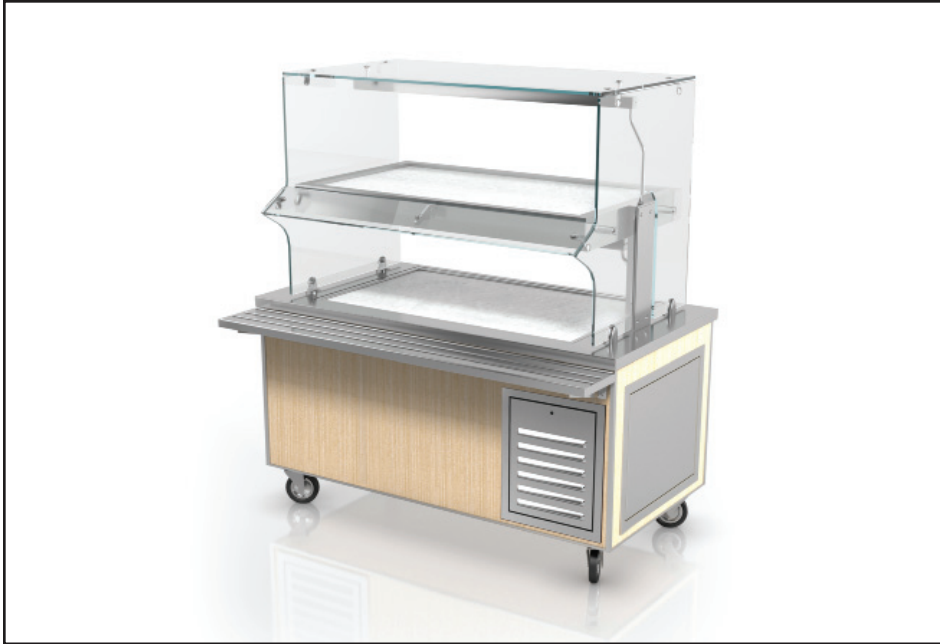
60-CFT-L shown with options: (A) beaded stainless steel tray slide, (OP) offset panels, a two tier frost top overstructure, and (RR) LED lights.

Stainless Steel (S) or Laminate Panel (L)