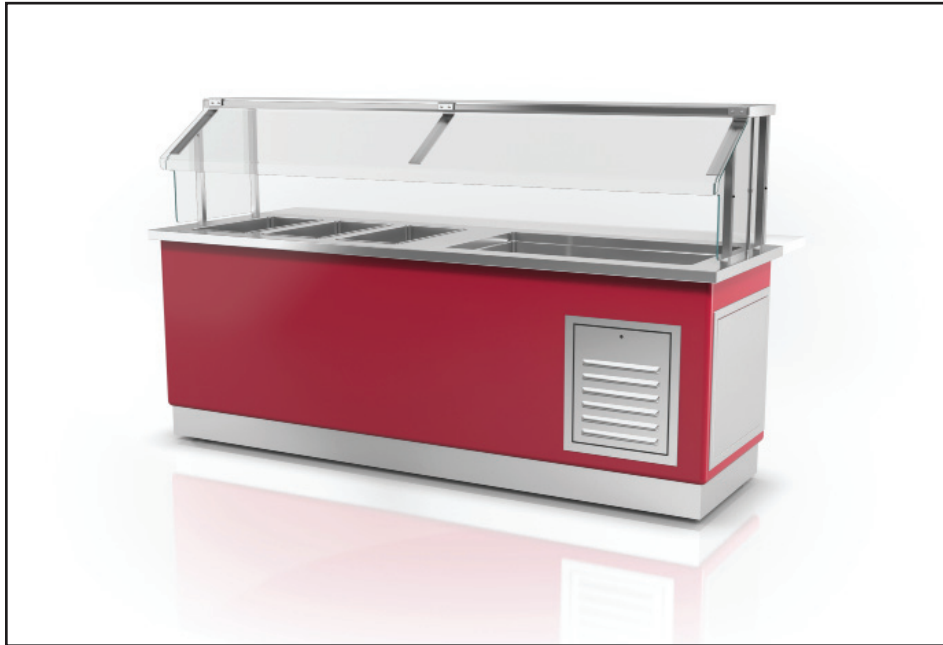
CPT-93-RX-F shown with options: (E) 8" wide Richlite® composite cutting board, (M) hinged single service buffet shield, and a removable stainless steel toe kick.