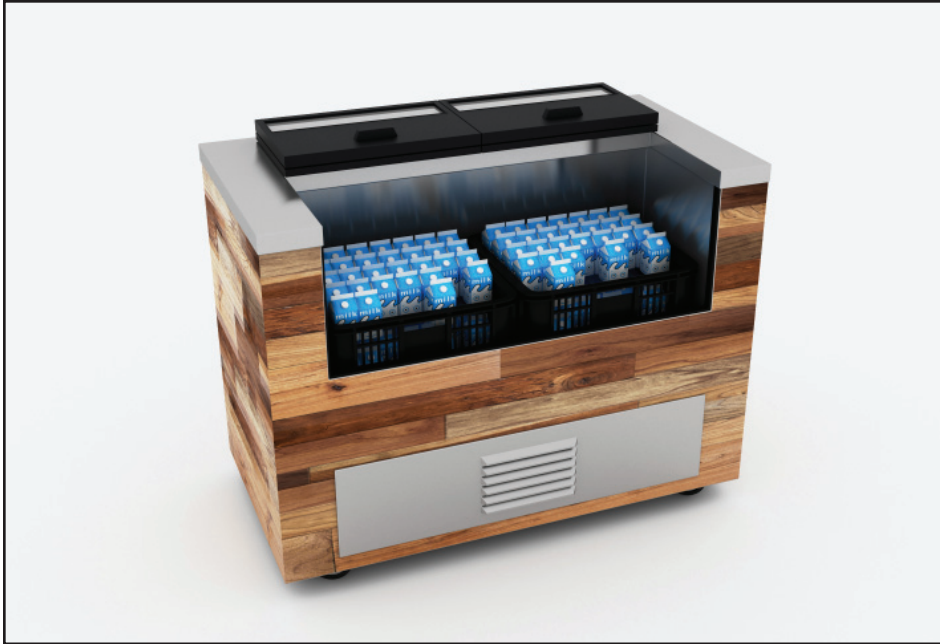
CPM-BFD-16 shown with vinyl graphic wrap option.