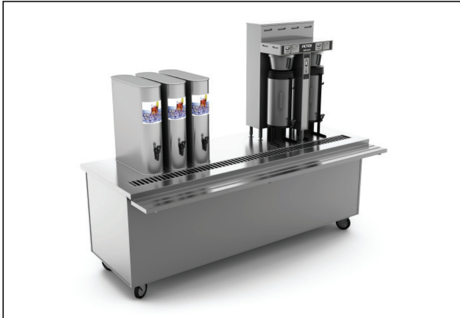
96-BT-L shown with option: (A) beaded stainless steel tray slide.

Stainless Steel (S) or Laminate Panel (L)