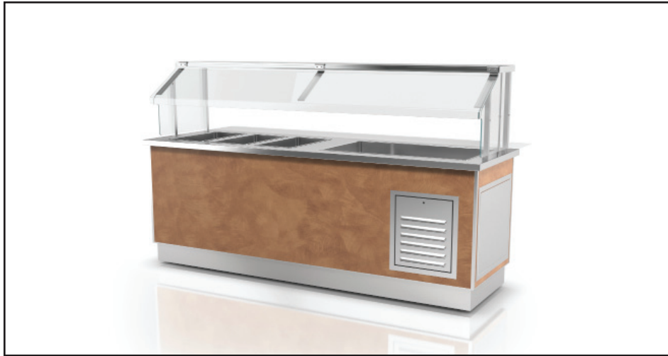
CPT-93-RA-L shown with options: (E) 8" wide Richlite® composite cutting board, (M) hinged single service buffet shield, and a removable stainless steel toe kick.

Stainless Steel (S) or Laminate Panel (L)