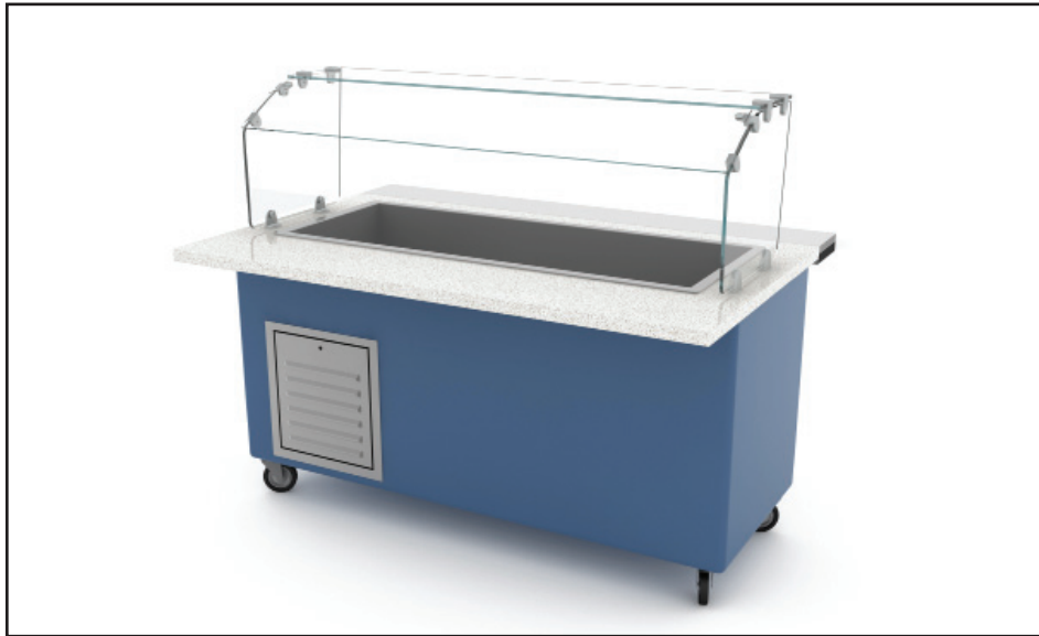
74-CFMA-F shown with options: (QT) stone top, (TE) top width extension, (E) 8" wide Richlite® composite cutting board, and (CCB) curved tempered glass buffet shield.