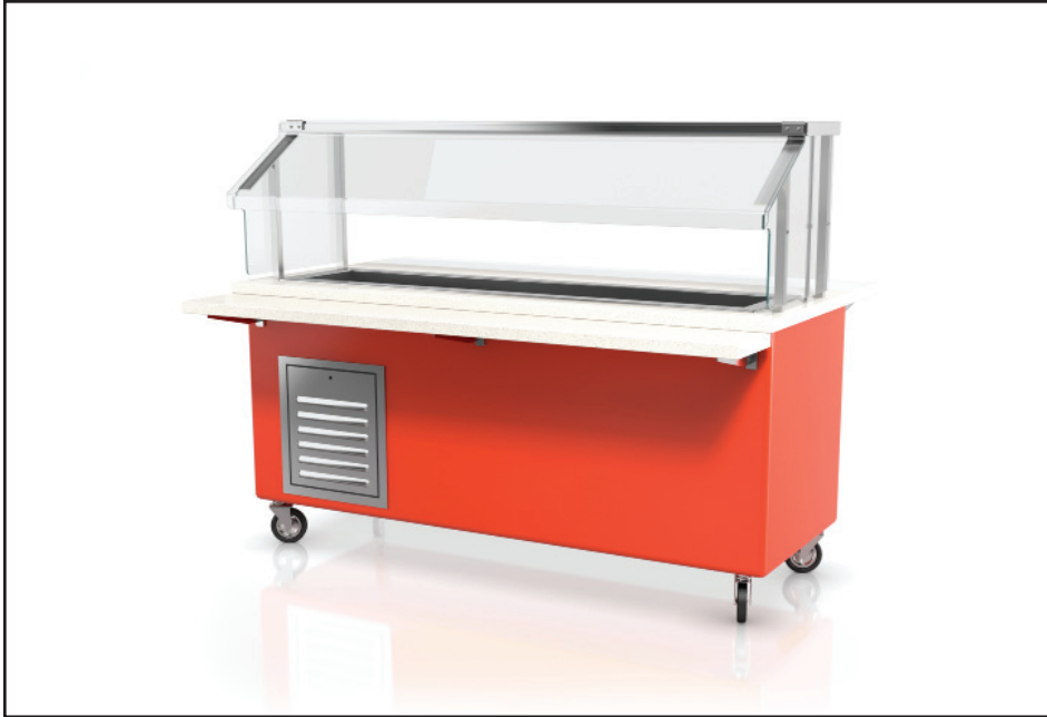
74-CFMX-F shown with options: (CT) Corian® top, (CTS) Corian® tray slide, Corian® cutting board, and (M) buffet shield single service hinged food protector.