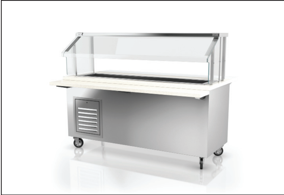
74-CFMX-S shown with options: (CT) Corian® top, (CTS) Corian® tray slide, Corian® cutting board, and (M) buffet shield single service hinged food protector.

Stainless Steel (S) or Laminate Panel (L)