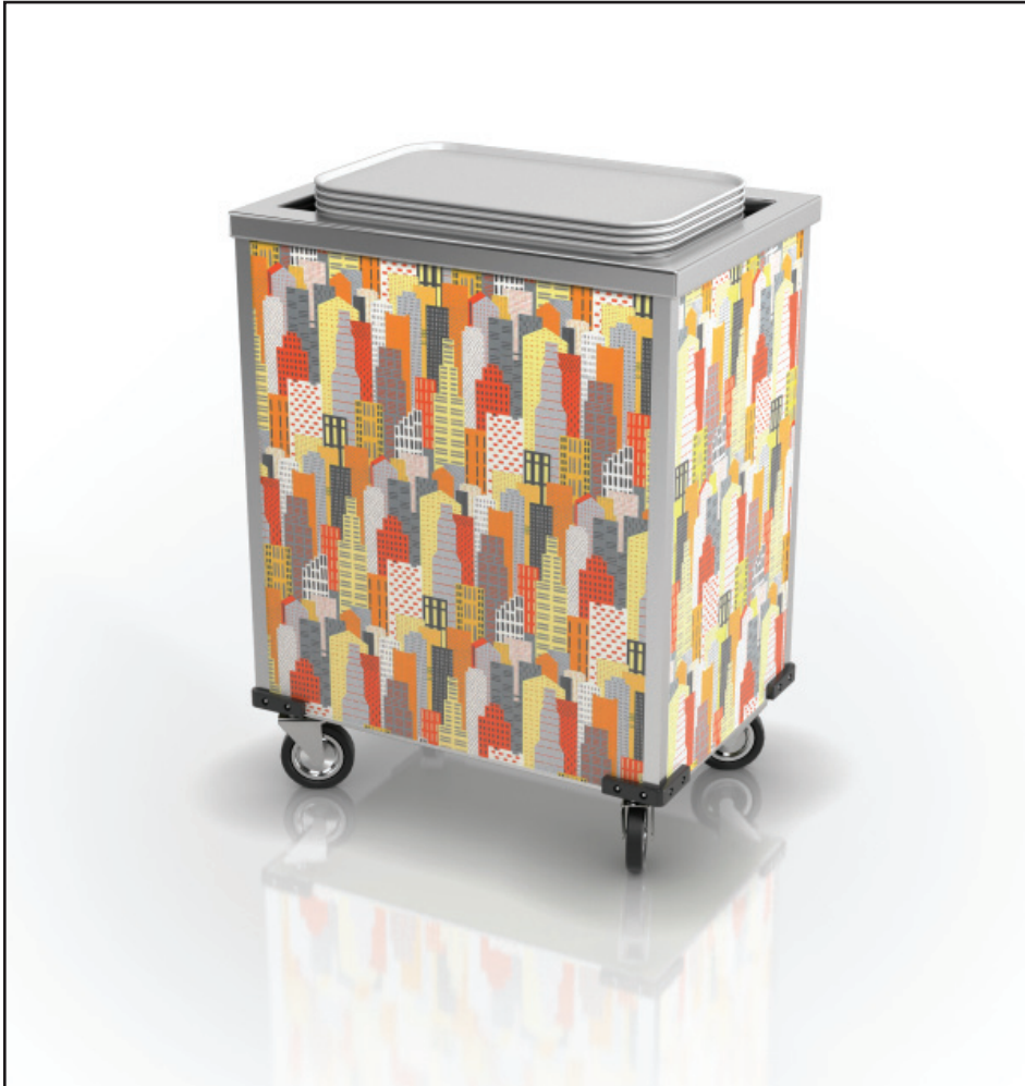
TD-1418 shown with option: (YY) Laminate plastic body panels