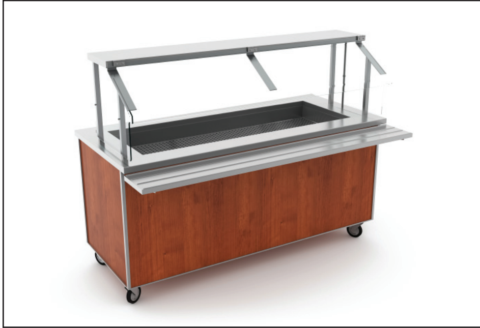
74-CFI-L shown with options: (A) Beaded, stainless steel tray slide and (M) buffet shield single service hinged protector.