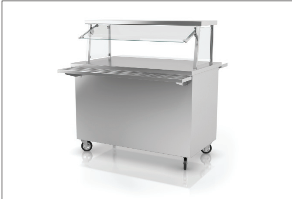
50-CPS-S, shown with options: (A) beaded stainless steel tray slide, (E) 8" wide Richlite® composite cutting board, and (GA) sloped front adjustable protector.

Stainless Steel (S) or Laminate Panel (L)