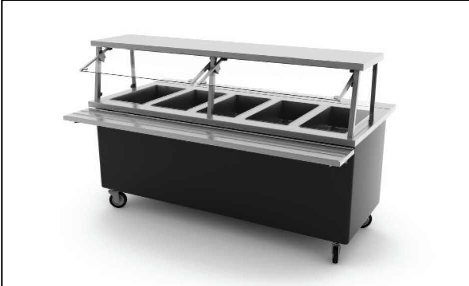
EF5-CPA-F, shown with options: (A) beaded stainless tray slide, (D) 8" stainless cutting board, and (GA) sloped front adjustable protector.