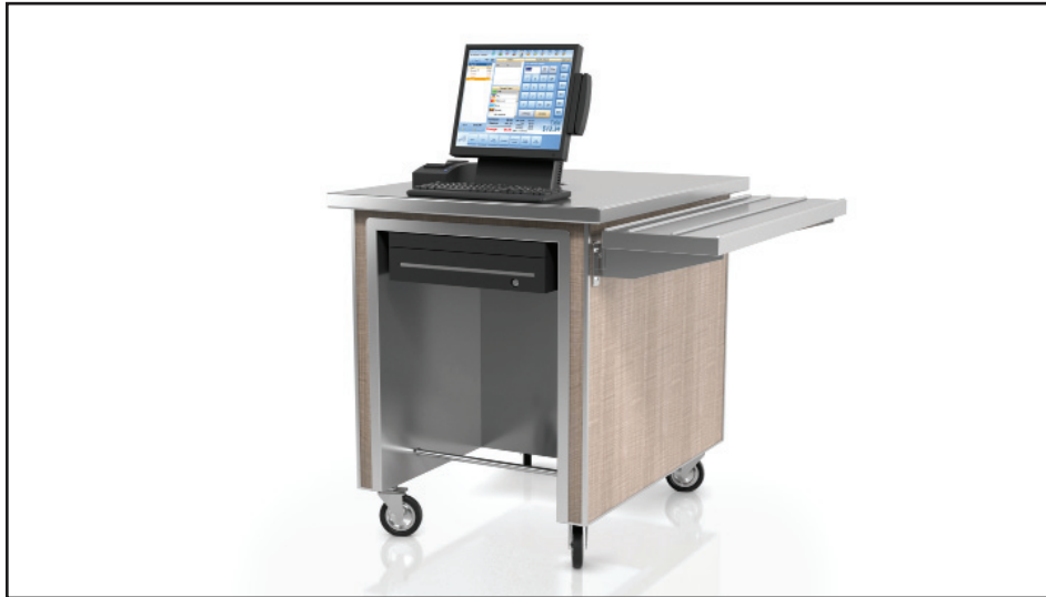
36-CSE-L shown with options: (A) beaded stainless steel tray slide, and (HH) locking cash drawer.

Stainless Steel (S) or Laminate Panel (L)