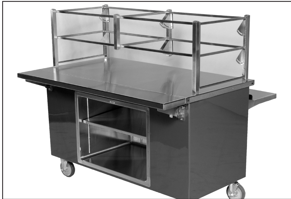
ST-66 shown with 8" stainless cutting board, double display shelves and 12" stainless tray slide (32" O.F.)