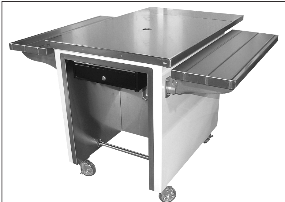
28-CSE shown with solid tray slides, cash drawer and fold-down end shelf.